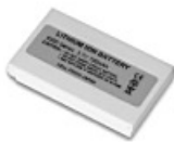
Rechargeable Lithium-ion Battery Pack