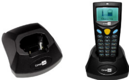
Charging & Communication Cradle